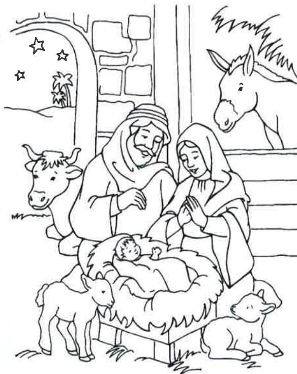
She wrapped him in cloths and laid him in a manger, because there was no room for them in the inn.