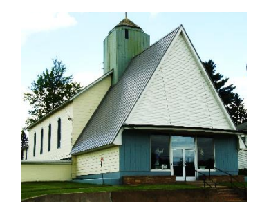
Sacred Heart of Jesus

W778 County Road N Aurora, WI 54151 P.O. Box 235 St. Anthony office hours 9am-12noon on Thursday