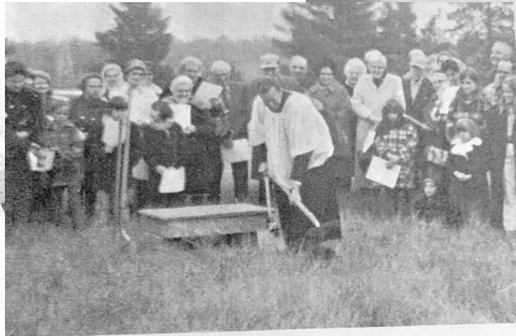
Ground Breaking Ceremony November 5, 1972