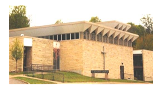
St. Anthony of Padua

1432 River St. Niagara, WI 54151 (715) 251-3879